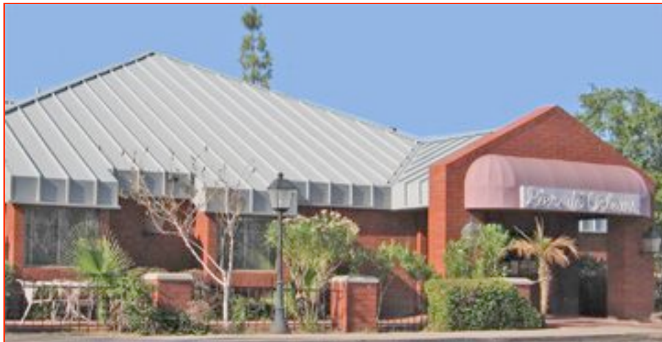
Pier D’Orleans 61 E. University Dr. Mesa

$20 per person --- Enclosed: $ _____ for _____ places